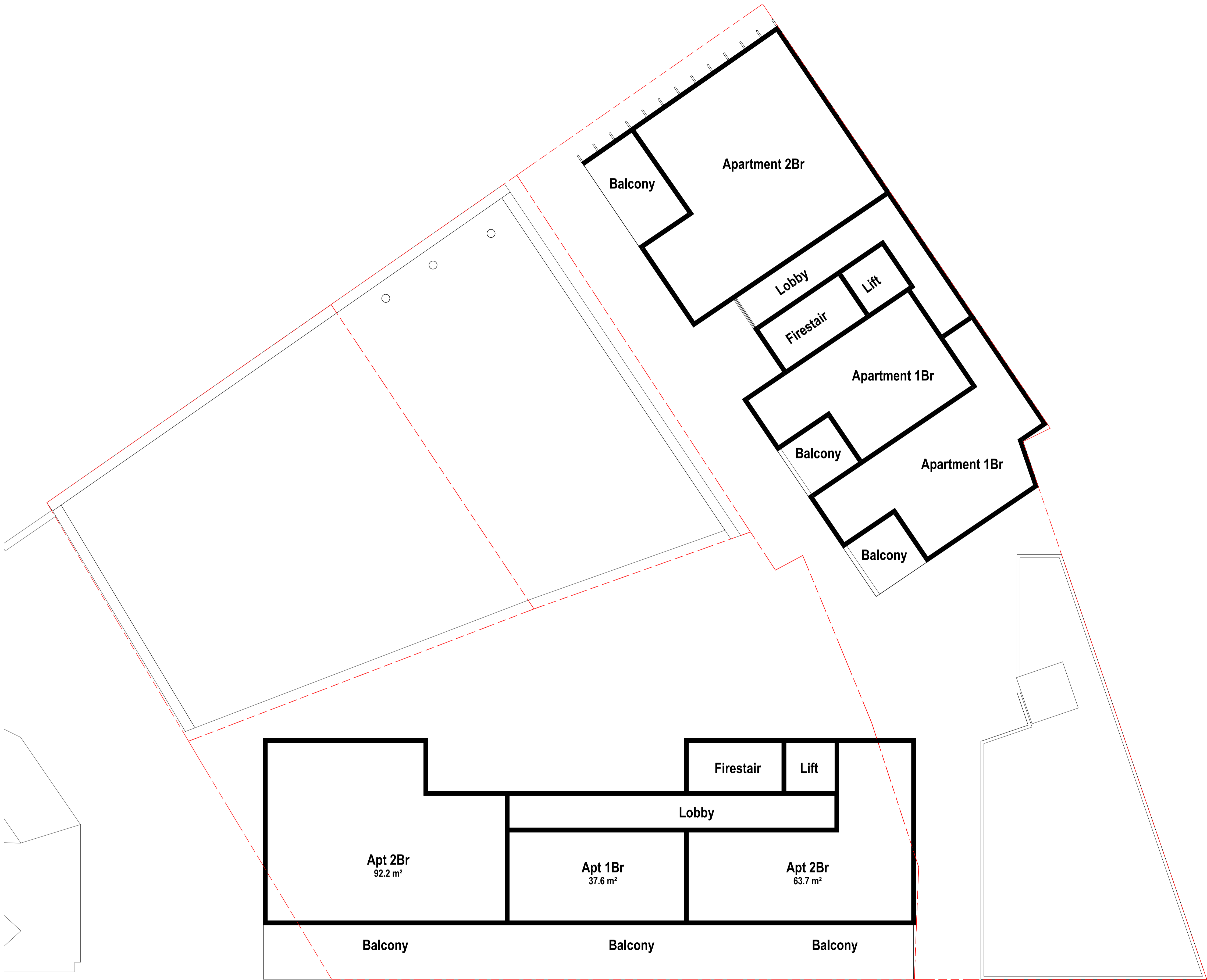
1 GA Plan - Level 04 - Proposed